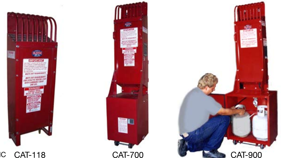
CATALYTIC CAT-118 PORT BURNER X-118 DESCRIPTION: Wall Mount

Our Catalytic Cargo Heaters (available in all three styles) are fool-proof and flameless, designed to deliver clean even heat throughout the cargo space. Each model features U.S. made and approved components including safety shut off, thermostat controls and manual pilot light spark ignition. Available in three models, the long-range over-the-road double bottle CAT-900, the single bottle CAT-700 for city pick-up and delivery, and the CAT-118 for trailer or van bodies where externally mounted bottles are desired.